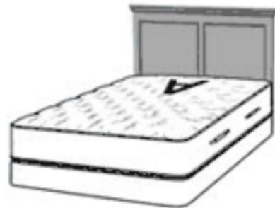
2. Realign mattress with foundation.